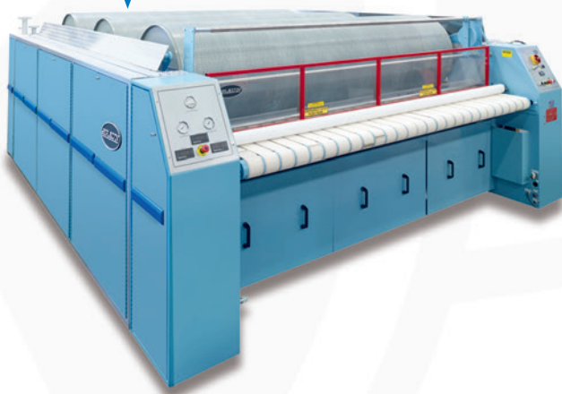
Braun Delta Flatwork Ironer Large Diameter Rolls

Ironers with 32" diameter rolls can be lifted up to 15 3/4" out of the chest by pneumatic pressure cylinders, allowing easy cleaning and padding. (Ironers with 48" diameter rolls can be lifted up to 14"). If air pressure or power is suddenly lost, a safety switch automatically locks the roll in its raised position to prevent accidental lowering.