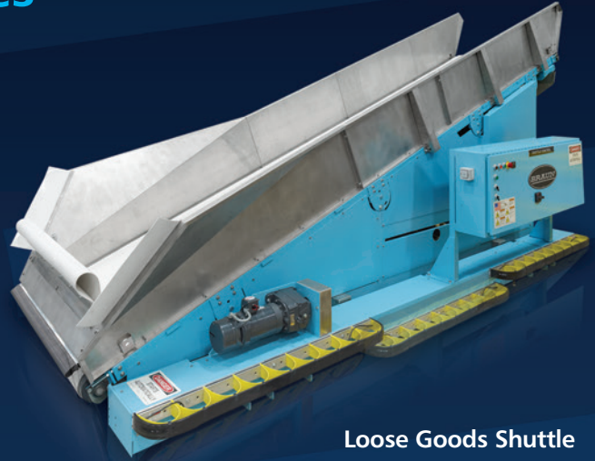
Loose Goods Shuttle