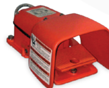
Foot Pedal Interlock