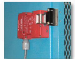
Safety Rated Door Interlock