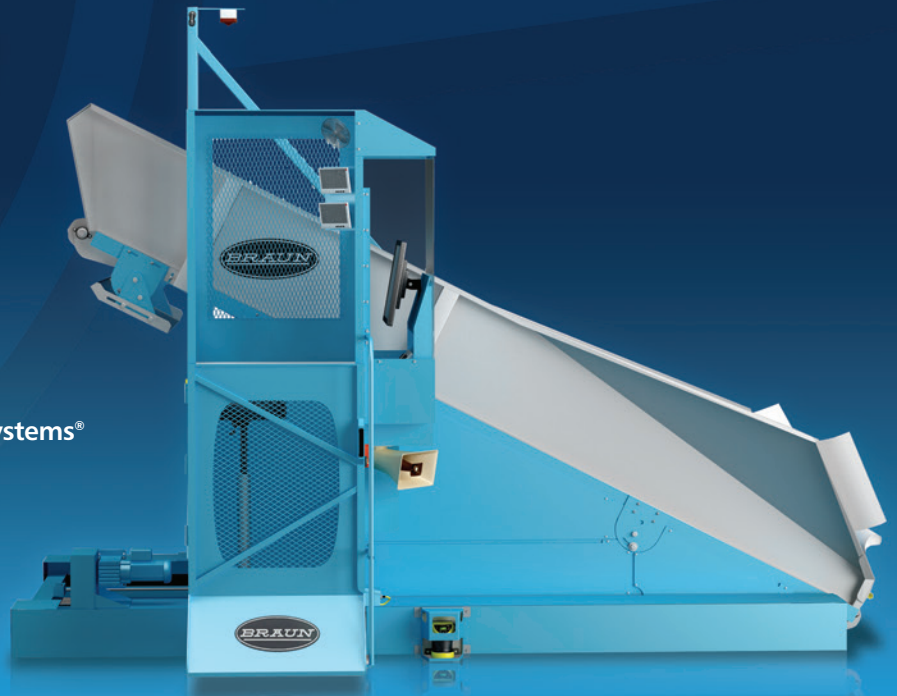
SafeLoad Shuttle Systems®