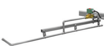
Air Fold Option

The machine can be ordered with a first cross-fold air jet or knife fold option. The knife fold option is ideal for processing linens, while the air fold option is optimal for sheet folding. (Note: certain models can also process blankets.)