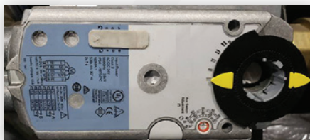
Modulating Gas Valve For Precise Temperature Control