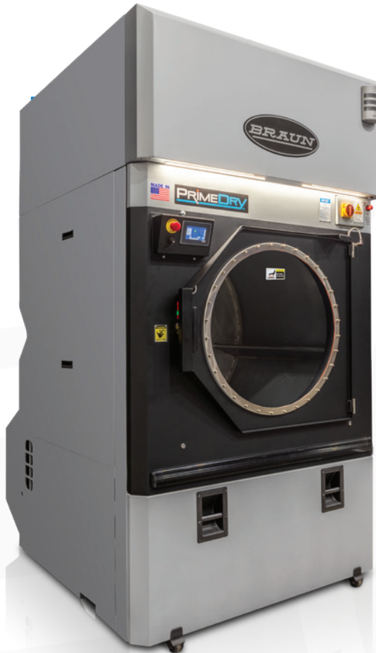
Braun PrimeDry 125-200lb Capacity Dryer.