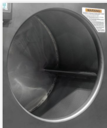
Stainless Steel Dryer Basket