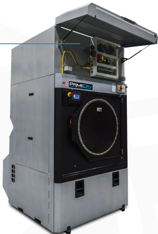
Braun PrimeDry Split panel control box